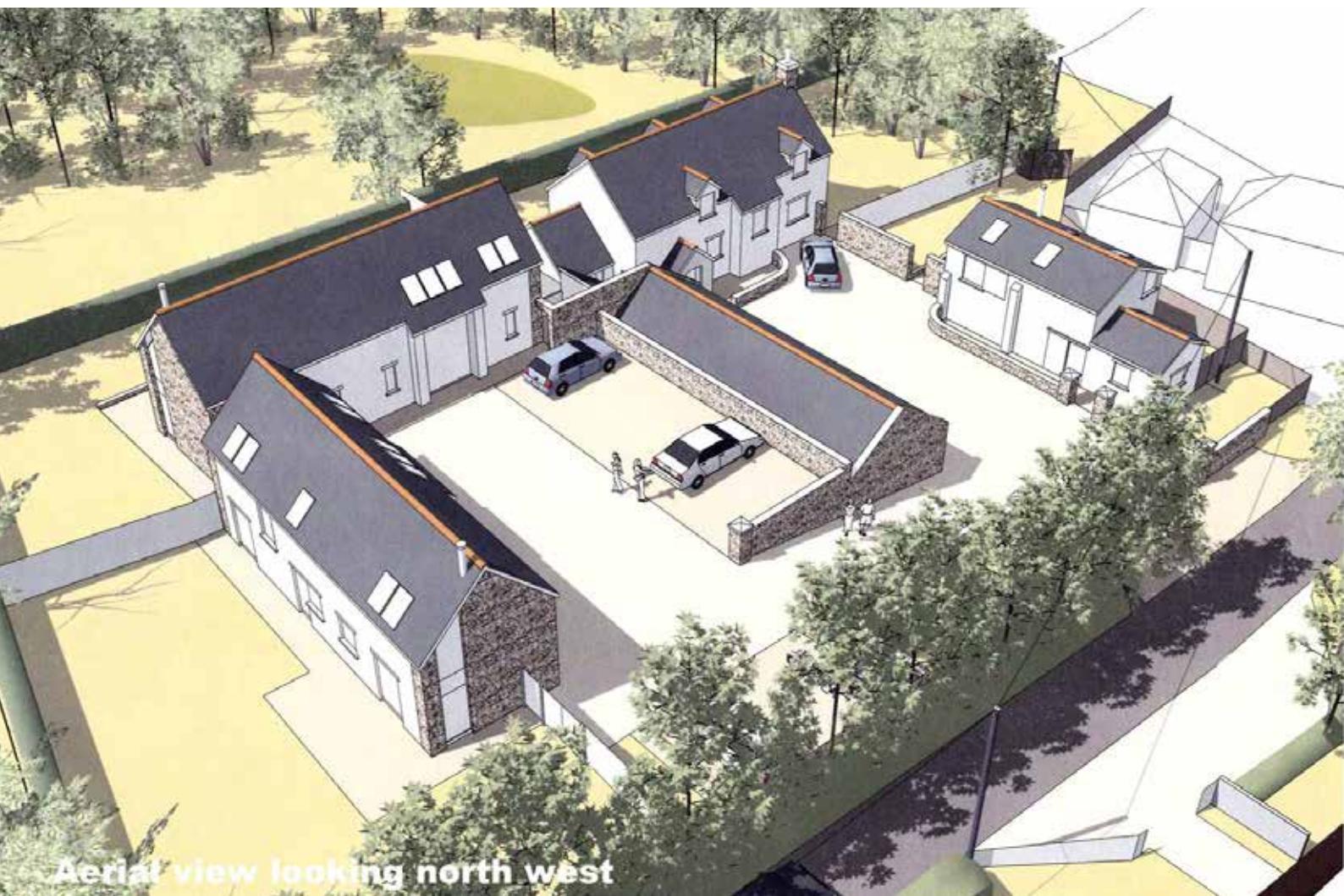
Aerial view looking north west