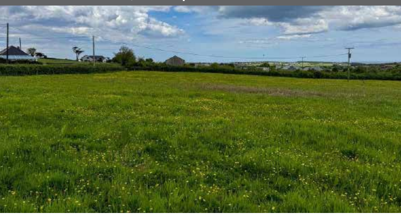
An attractive and very gently sloping pasture field extending to approx. 4.63 acres, well fenced with road frontage and good

Marhamchurch, Bude | Guide Price £100,000