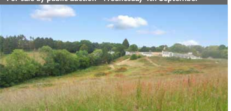
The land extends in all to approximately 4.91 acres comprising a single enclosure of pasture and amenity land.

Land at Lower Clicker Road Menheniot, Liskeard | Auction Guide Price £50,000 - £55,000 For sale by public auction - Wednesday 4th September