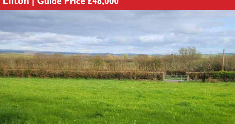
A small parcel of gently sloping pasture land extending to some 2 acres, perfect for amenity or equestrian use. Boasting far reaching countryside views and parish road access.

Holsworthy Farms & Land Department farms@kivells.com | 01409 259547