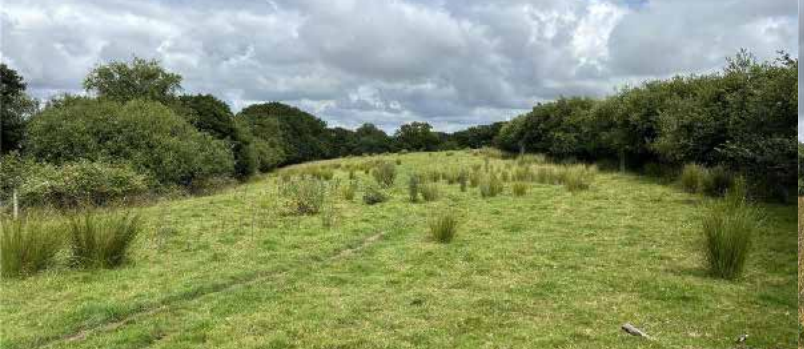
Approx. 2.50 acres in a single triangular shaped, mainly level grass field with natural hedge bank boundaries.

Whitstone, Holsworthy | Auction Guide Price £25,000 - £30,000 For sale by public auction - Wednesday 4th September