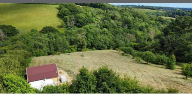
Approximately 3.62 acres of orchard, pasture and woodland with a range of buildings including a timber frame cider barn, small timber cabin and touring caravan.

Wringworthy, Morval, Looe | Auction Guide Price £60,000 - £65,000 SOLD: £71,000